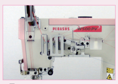
Equipped with the needle thread take-up and safety protection that same as W500P type.