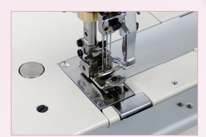
G auge parts are the same like W500P and W1500P series.