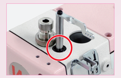
New type of oil-seal in the top of needle bar bushing.