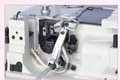
Micro-adjuster effortlessly makes fine adjustments for the looper front-to-back position.