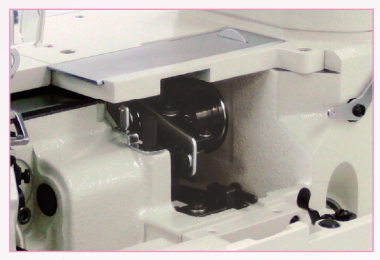
S wing in and out looper thread take-up for easier threading.