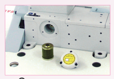
Oil circulation by oil pump and equipped with oil filter.